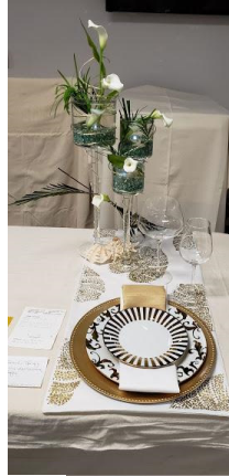
Fran McIntyre - Table setting for a Sea Captain's Elegant Dinner on board