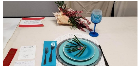
Sylvia Swartz - Table setting for a Sea Captain's Elegant Dinner on board