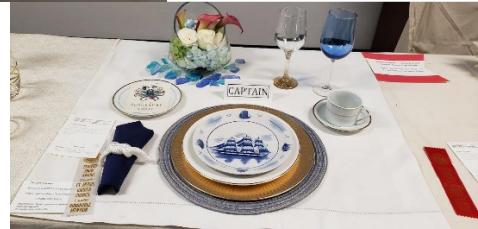
Sandy Gove - Table setting for a Sea Captain's Elegant Dinner on board