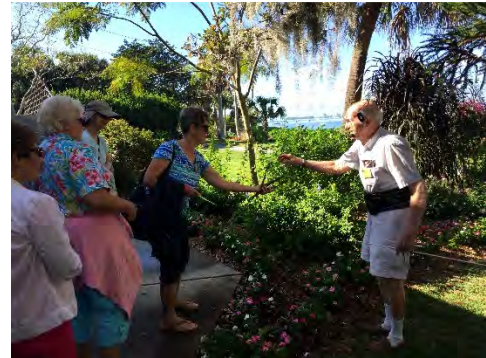
Our excellent guide